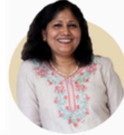
Afsari - Bangladesh