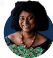
Yipin - Burkina Faso